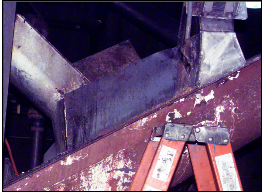
Photo 2 – Entanglement occurred in inclined auger beneath open hopper (above and left of ladder used by responders and behind tear in side of hopper above ladder made during extrication efforts).

The victim had climbed up the incline of the 10-inch (0.25 m) diameter auger to retrieve hardware that had fallen into the auger or hopper (Photo 2). A coworker noted the victim had located the hardware and was about to climb down when he slipped into the hopper at the same time the auger started. His feet and lower legs were drawn into and up the auger.