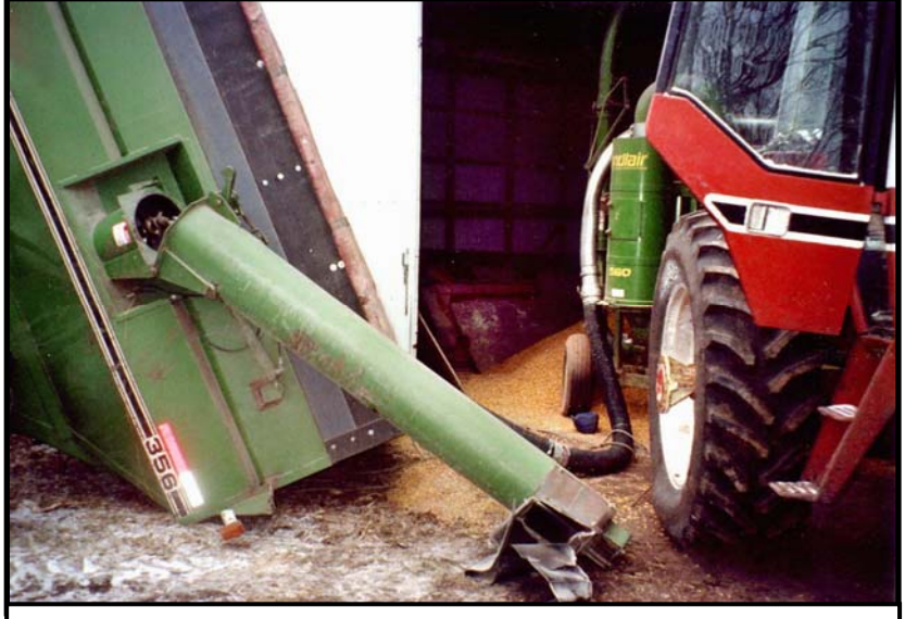
Photo 1 – Grain cart tipped onto its rear beside tractor used to power the portable grain vacuum that conveyed corn into the machine shed.

During the winter of 2005, an 81year-old farmer died while pneumatically conveying corn from a parked auger wagon into an area of his machinery storage shed. He was standing in the corn near the front of the single-axle grain cart, which had been unhitched from the tractor. The PTO-driven grain vacuum was positioned in the doorway with the tractor connected to it, to provide power take-off (PTO) power, at an angle to it outside the doorway (Photo 1). When a sufficient amount of corn had been vacuumed from the front of the wagon, the weight of corn remaining in the rear of the