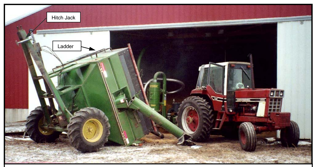
Photo 2 – Overview showing the tractor, grain vacuum, and the grain cart tipped rearward. Note the ladder on the front of the cart and the down position (for parking) of the jack attached to the hitch frame.

The grain cart was moved into position and unhitched from the tractor. There was significant weight on the tongue of the cart when it was disconnected so that its tongue jack needed to be lowered to enable unhitching, which also kept the grain cart hitch from dropping to the ground. The access ladder to this grain cart is over the hitch frame at the front of the grain box (Photo 2). The farmer climbed the ladder and stepped into the grain cart carrying the intake nozzle and dragging the hose of the grain vacuum with him. While he was suctioning grain from the front of the cart, at some point in time the weight of grain ahead of the rear axle was reduced such that the remaining grain behind the rear axle of the cart was enough to cause the cart to tip rear-ward.