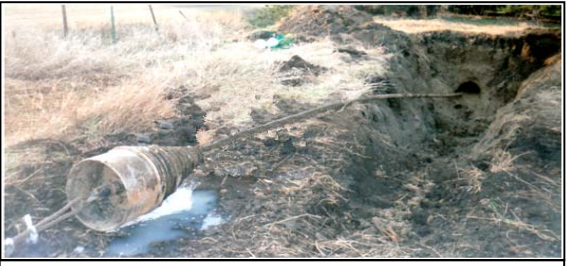
Photo 2 – Reamer connected to drill line at location where victim was found. Note arc in drill line and the reamer's position on the shoulder of the guide trench. Cable from reamer is connected to the pulling head secured to the pipe.

The drill rig operator had radioed the victim asking if he was ready for the reamer to be rotated and for the pullback or back-reaming to begin. The victim reportedly responded affirmatively. Soon after engaging power, the operator radioed the victim to ask how the reamer was progressing, but received no response. The operator halted power to the drill line and radioed others to have them check on the exit pit area worker. The supervisor discovered the victim's body wrapped around the drill rod just ahead of the reamer.