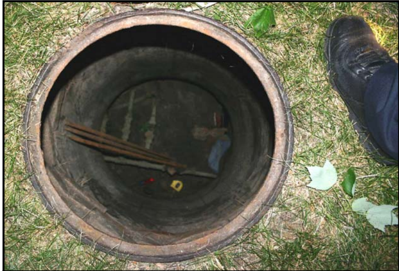
Photo 2 – Shutoff valves at bottom of manhole vault controlled the supply of water to adjacent homes. Tools for operating them lean across the entry way.

Approximately 175 mm (7 in) up from the sand floor, midway up in the flared-out bottom zone, a 25 mm (1 in) diameter water line ran horizontally, a little off of center, across the pit (Photo 2). Connected to this supply line were three water lines, one for each house served on that side of the street. Each water line had an inline shutoff valve. The private company supplying water for the city did not own nor did they lease this service manhole from the property owners. Hand tools (rods with tools attached to their ends) to operate the shutoff valves without entering the manhole were propped within reach against the side of the cylindrical shaft.