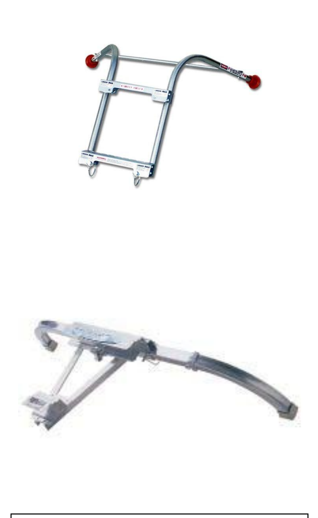
Exhibit 2. Examples of ladder stabilizers