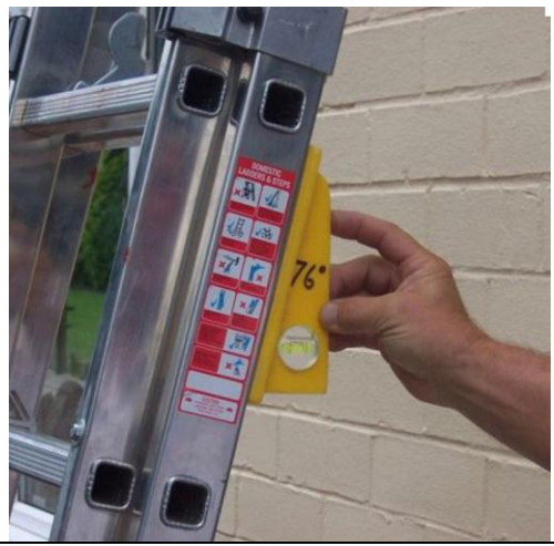
Exhibit 4. Proper height-to-base ratio and ladder angle to set up portable extension ladders