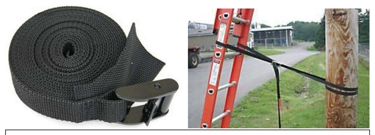
Exhibit 3. Examples of tie-down straps, not specific to this investigation

Near the end of the work day, the helper announced to the owner that he was bringing a tarp up to the roof because rain was forecast for that evening. The owner, working on the opposite side of the roof gable where he could not see the ladder and victim, heard the clatter of the ladder falling after the tarp was brought to the roof. He quickly came over the gable roof to see the helper lying on the foundation retaining wall of the structure that was razed. The tarp was on the roof, and the bottom of the ladder had slid sideways and fallen to the ground. The nylon tie-down strap was broken, but the screwed-down section of strap was still affixed to the roof, and the stabilizer bar had come apart from the ladder. The business owner immediately called 911 on his cell phone at 1654. The victim had fallen an estimated minimum distance of 10 to 12 feet onto the elevated area of the foundation retaining wall located to the victim's left as he traversed the ladder.