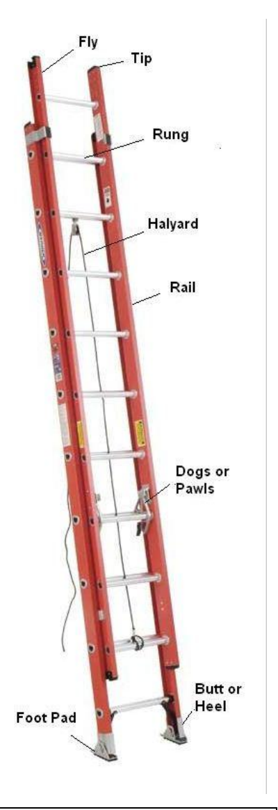
Exhibit 1. Example of a 2-section fiberglass extension ladder

approximately 3 feet beyond the roof eaves. The ANSI duty rating of the ladder was not known. A stabilizer bar (Exhibit 2) was affixed to the upper section of the ladder with pins and clips. A nylon tie-down strap (Exhibit 3) attached to the stabilizer bar was screwed onto the roof deck to secure the top of the ladder in position. The type and size of the tie-down strap and the screw used to secure the strap to the roof was not known. The bottom of the cleated ladder rested on dry level ground of earth and gravel, but was not staked to the ground or secured to a permanent fixture.