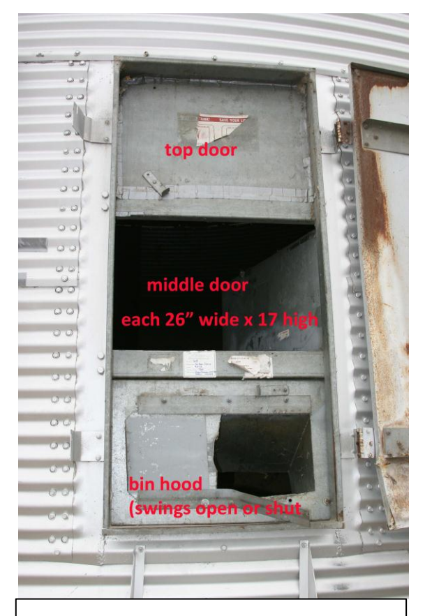
Exhibit 2. Side access door

Exhibit 1: Grain bin where engulfment occurred