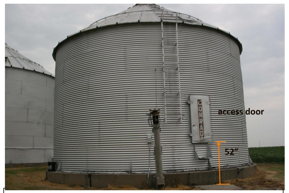
The night before the fatality, the farmer worked alone and emptied one or two semi loads of beans from the bin. He used an REM 3700 grain vacuum that was purchased new, two years prior to the incident (Exhibit 3).<sup>1</sup>

Exhibit 1: Grain bin where engulfment occurred