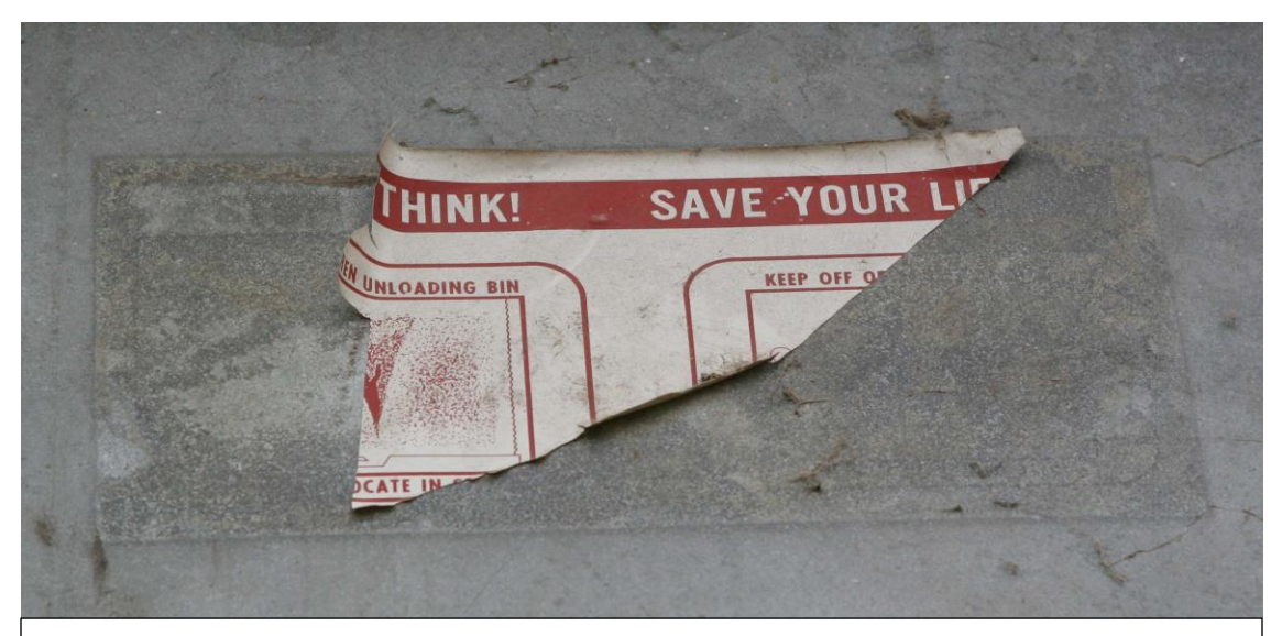
Exhibit 6. Warning sign that was on the top section of the bin's side access door

The Iowa FACE project thanks this victim's family and employee for assistance in developing this case report.