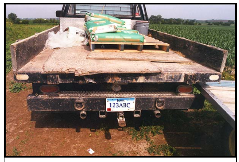
Photo 3 - View of rear of truck showing relative position of bumper and truck bed. Hay wagon shown to the right is typical, but is not the one involved in this incident.

On the day prior to this incident, the work crew of four had baled about 800 bales of hay, using a conventional square baler, which creates bales that weigh about 40-60 lbs (18-27 kg). They had baled several loads of hay and, early the next morning, were in the process of moving this hay into storage. The 12-year-old boy was big and strong for his age, and could easily handle the hay bales. Nonetheless, the farmer would move bales stacked too high for the helper, and leave the lower bales for the boy, who was earning extra money to attend the county fair.