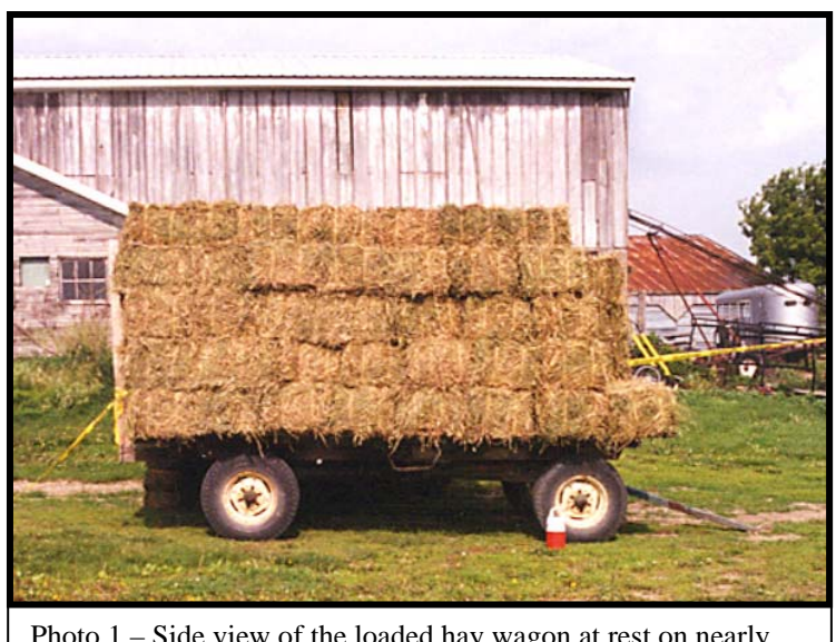
Photo 1 – Side view of the loaded hay wagon at rest on nearly flat ground in the farmyard.

In early summer 2004, a 12-year-old boy was killed while helping a farmer, his uncle, hitch a hay wagon to a truck. They had been baling hay the day before and, next morning, were preparing to unload the hay bales from the hay wagon/hayrack, which was parked in the farmyard (Photo 1). The farmer was driving a 1-ton flatbed truck, which he had just backed up to the front of the hay wagon. The boy jumped out of the truck to hitch up the wagon, and when he lifted the tongue on the wagon, the wagon apparently started to slowly roll forward toward the truck. The boy failed to get the tongue hitched to the rear of the truck, and the wagon continued its