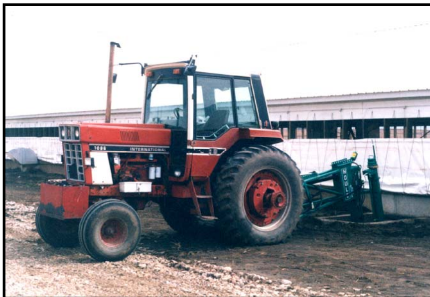
Photo 2 – Tractor in position with attached pump to agitate manure slurry.

The farmer planned to collect a manure sample from the pit beneath the confinement building to have its nutrient level analyzed by the Iowa Department of Natural Resources. Prior to collecting this sample, it was necessary to agitate the pit, and the brothers had positioned a large row-crop tractor with a waste removal system attached to its power take off, and inserted this into the pit to stir the manure (Photo 2).